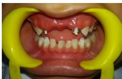
Fiber post placement