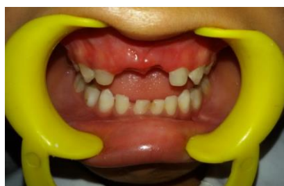
Composite build up