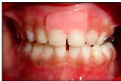
Functional space maintainer in place

❖ The poster currently has gross contents. It will be edited for final placement of edited text & images.