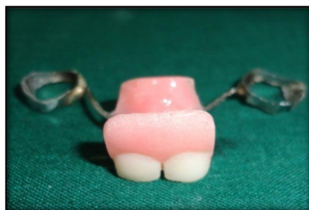
Functional space maintainer